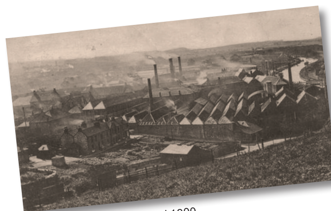
Industrial Bonnybridge around 1900.

Map design © HARVEY 2015 www.harveymaps.co.uk Contains Ordnance Survey data © Crown Copyright and database right 2015.